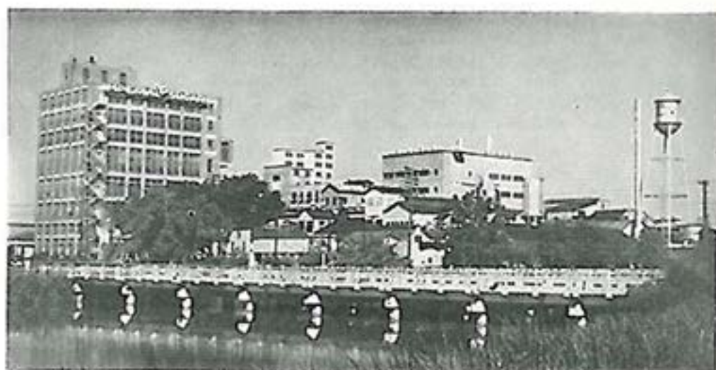
THE HOME OF IMPERIAL PURE CANE SUGAR SUGAR LAND, TEXAS